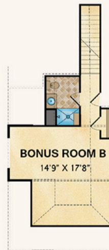
BONUS ROOM B