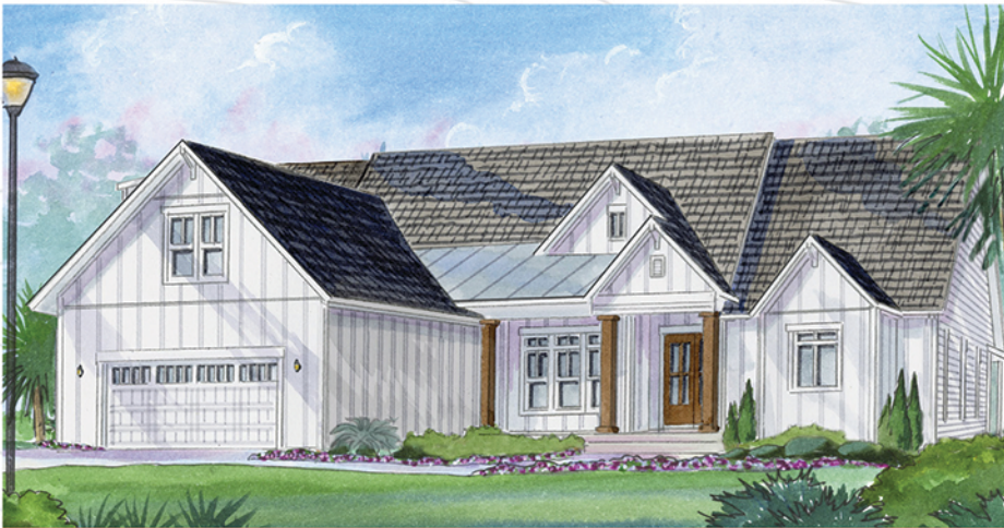
FARMHOUSE BONUS ROOM ELEVATION