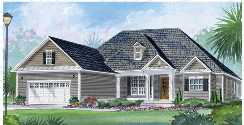
TRADITIONAL BONUS ROOM ELEVATION