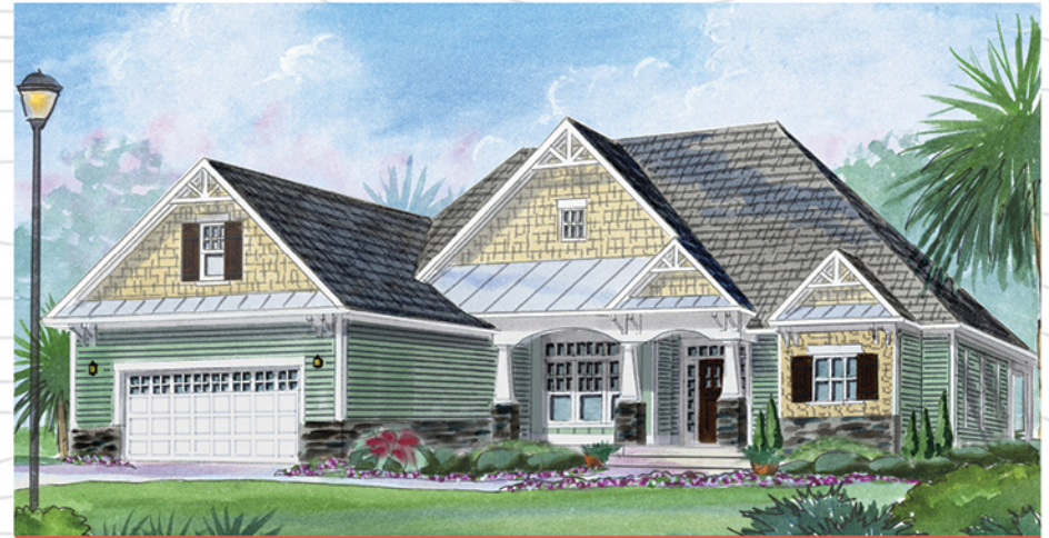
CRAFTSMAN BONUS ROOM ELEVATION