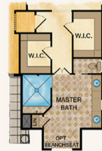
ALT. MASTER BATH