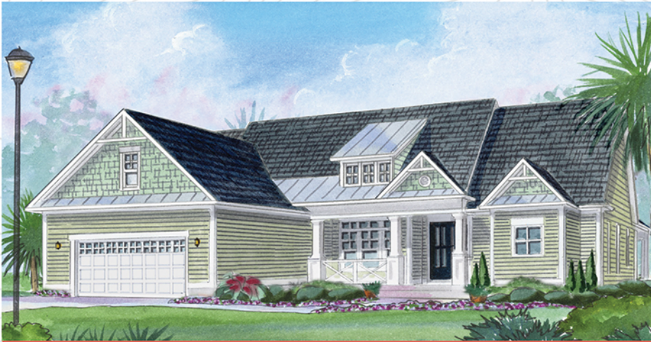
COASTAL BONUS ROOM ELEVATION