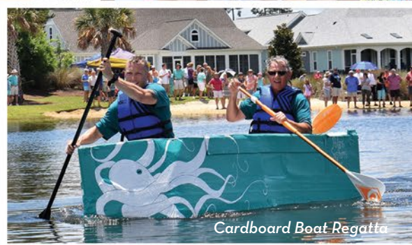
Cardboard Boat Regatta