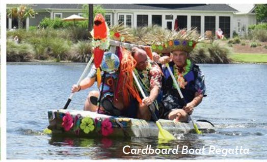
Cardboard Boat Regatta