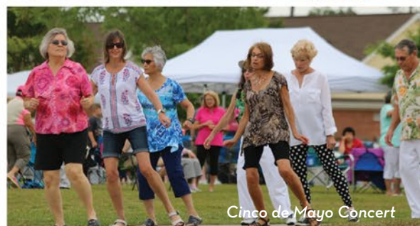
Cinco de Mayo Concert