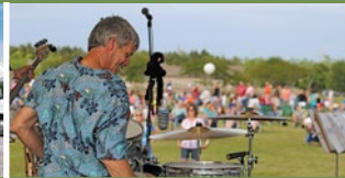
Concert in Annsdale Park October 6