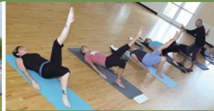
Health & Wellness Show October 6