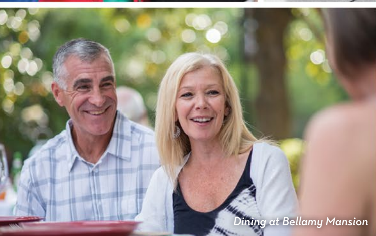
Dining at Bellamy Mansion