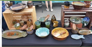
Craft Show November 10