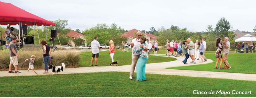
Cinco de Mayo Concert

Snapshots of residents and guests in action