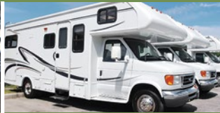
RV Show September 14-16