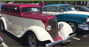
Classic Car Show August 18, 3pm-8pm