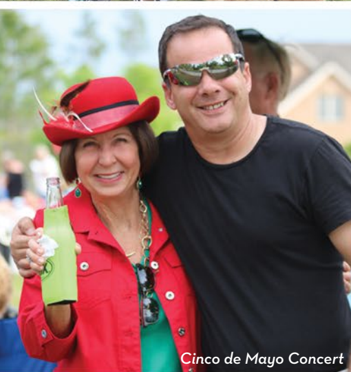
Cinco de Mayo Concert