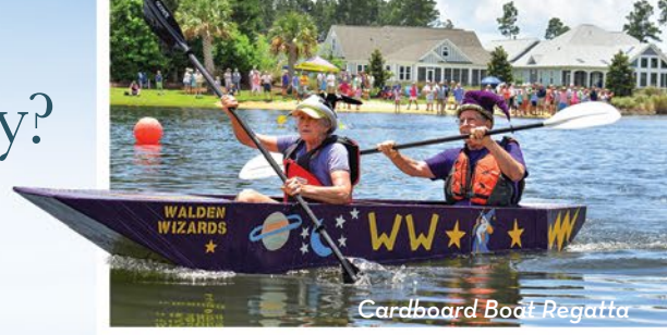
Cardboard Boat Regatta