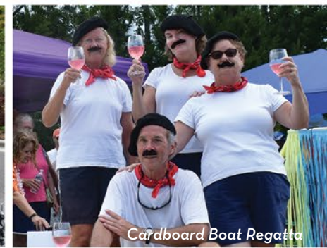
Cardboard Boat Regatta