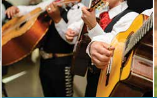
May 5 - Cinco De Mayo Spring Concert | Dog Show