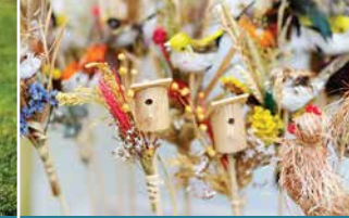
April 7 Spring Craft Market | Croquet Match