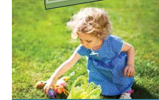
March 24 Community Egg Hunt