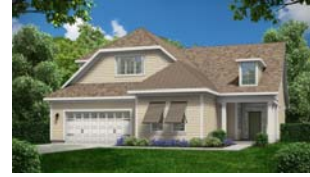
Optional Elevation C

KENT homes A SMARTER WAY TO A LUXURY HOME