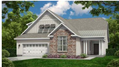
Optional Elevation B