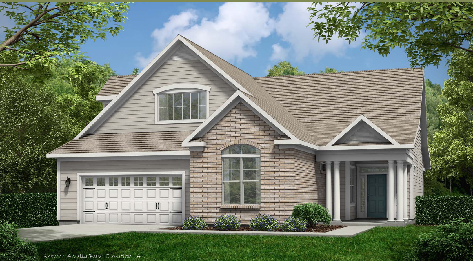
Shown: Amelia Bay, Elevation A