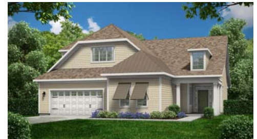
Optional Elevation C