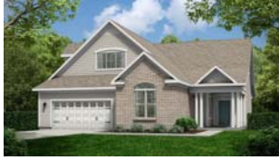
Standard Elevation A