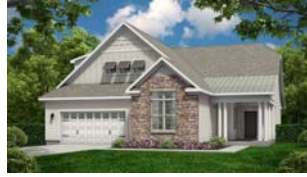
Optional Elevation B