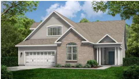
Standard Elevation A

The Amelia Bay offers that beautiful coastal home with a great open floor plan. A spacious kitchen with wrap-around counter and entertaining island opens up to a vaulted great room and vaulted dining room. Expansive doors lead out to a large screened loggia with adjacent patio to enjoy the coastal weather. A private master suite features his and hers walk-in closets, his and hers vanities, and a large spa-like walk-in shower. Two guest bedrooms and a second floor optional flex room with bath allows for plenty of space and storage.