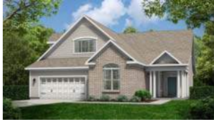
Standard Elevation A