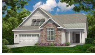
Optional Elevation B