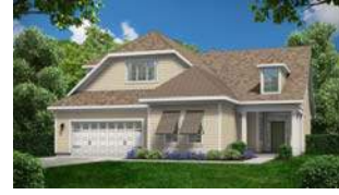
Optional Elevation C

KENT homes A SMARTER WAY TO A LUXURY HOME