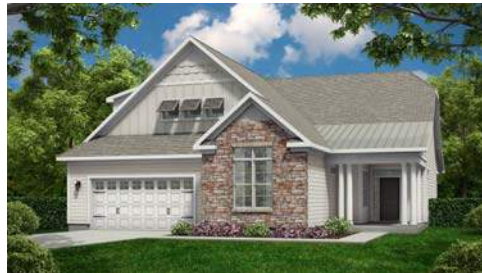
Optional Elevation B