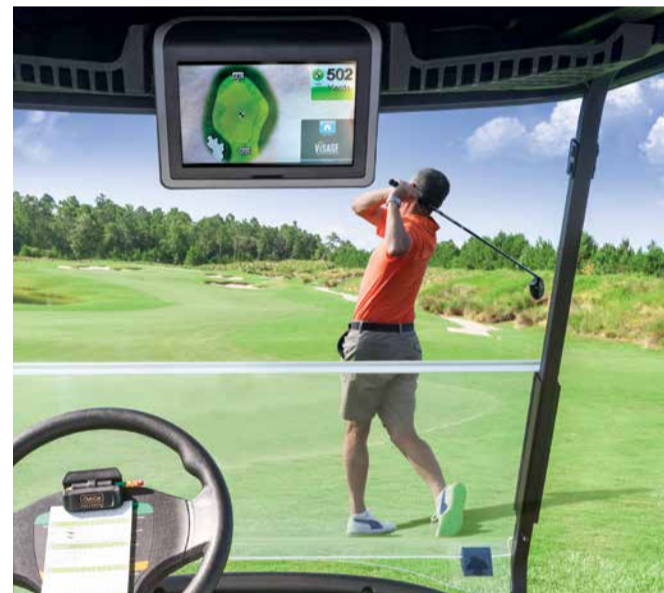
GPS carts enhance play at CFN

swimming pool in a community that offers three; the addition of a fleet of GPS-enabled golf carts that create a resort-style of play at Cape Fear National’ golf course; and the launch of a new, responsive website that allows a seamless transition to mobile use. The new website also gives users a direct link to the Cape Fear National site, and exceptional property search features. Take a look at BrunswickForest.com .