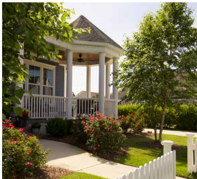
Residents enjoy front porch living