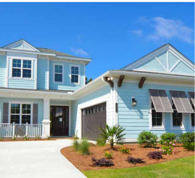
One of the West Indies-inspired Leewards homes