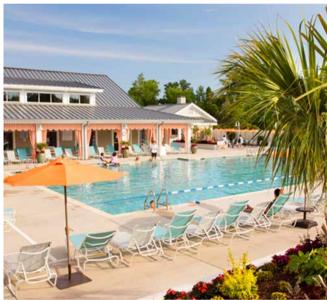
Renovated Fitness Center's outdoor pool

have an exceptionally strong builder team that is able to tackle large projects, such as entire new neighborhoods that showcase a consistent architectural style. In Banyan Bay, for example, we set a Floridian aesthetic in a gated enclave. The Leewards at Shelmore is West Indies inspired,