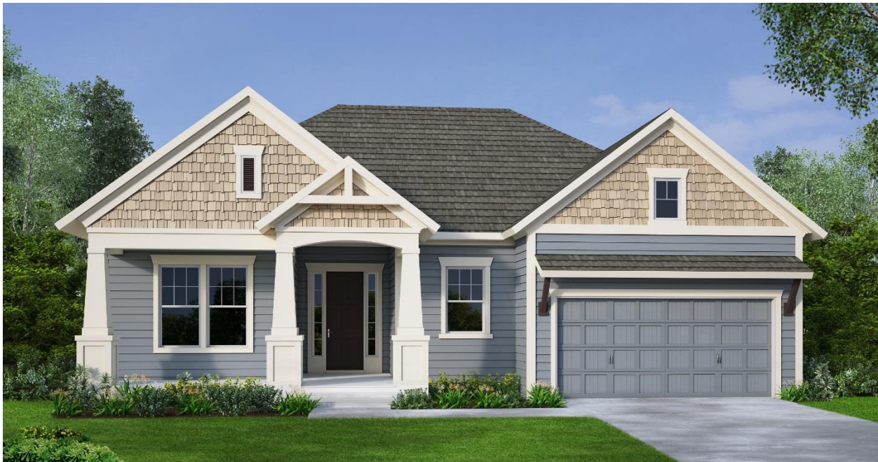
Seaver - Elevation A