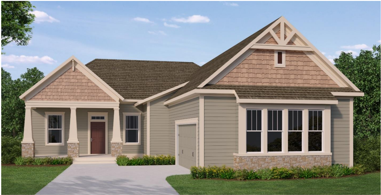
Granshire - Elevation A