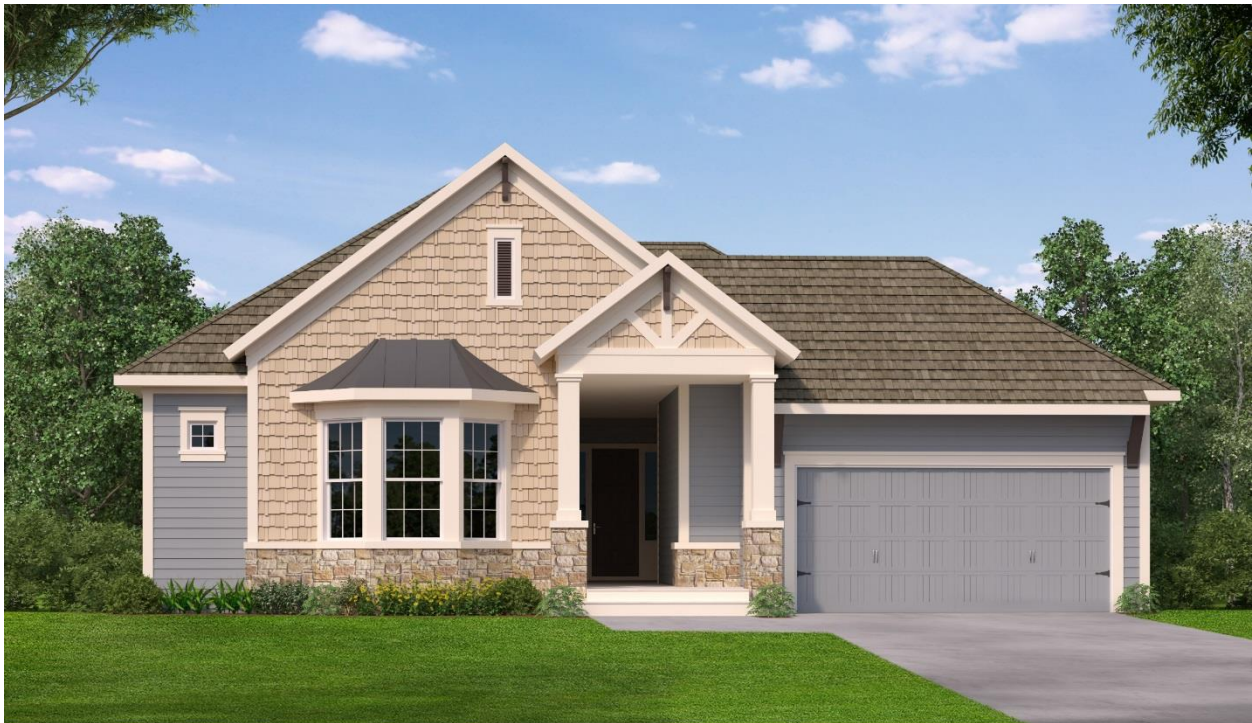
Feinberg - Elevation A