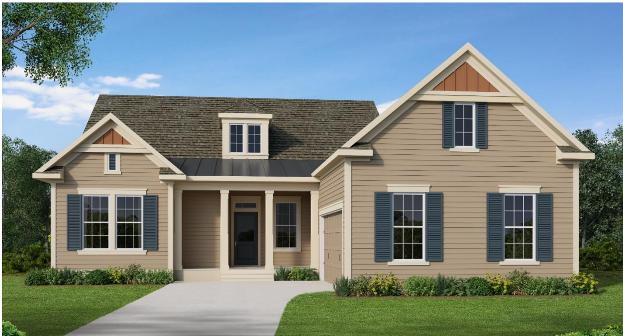
Caulfield - Elevation A