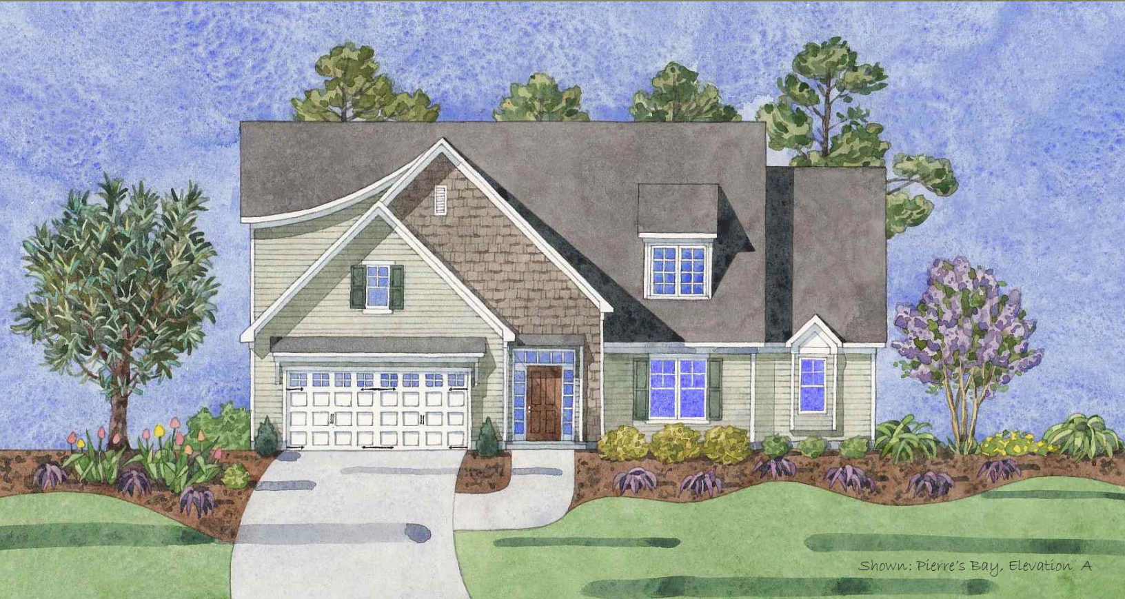
Shown: Pierre's Bay, Elevation A