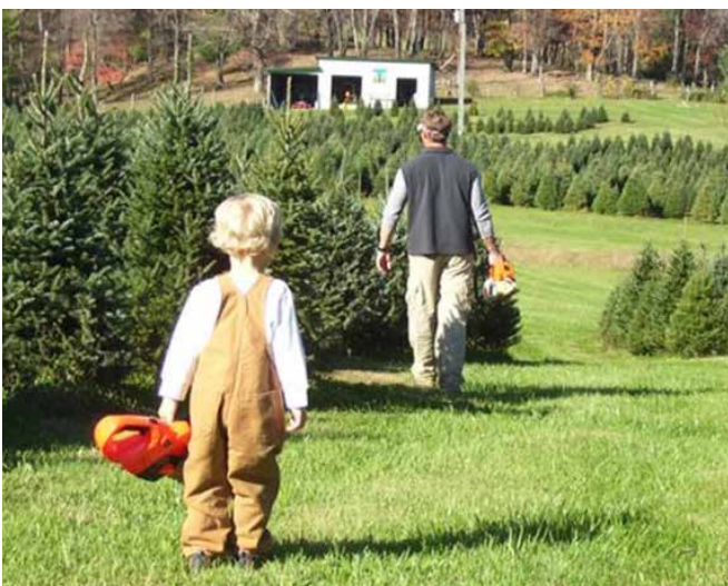
Choosing the perfect tree is a family tradition

The developers of Brunswick Forest, together with the merchants in The Villages at Brunswick Forest, are hosting a merry good time of family fun. At tonight's Holiday Celebration in the Villages,