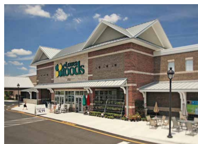
Front-door access to shopping, dining and medical services

Helms concluded with yet another Brunswick Forest advantage: location and convenience. "Not only are we so close to historic downtown