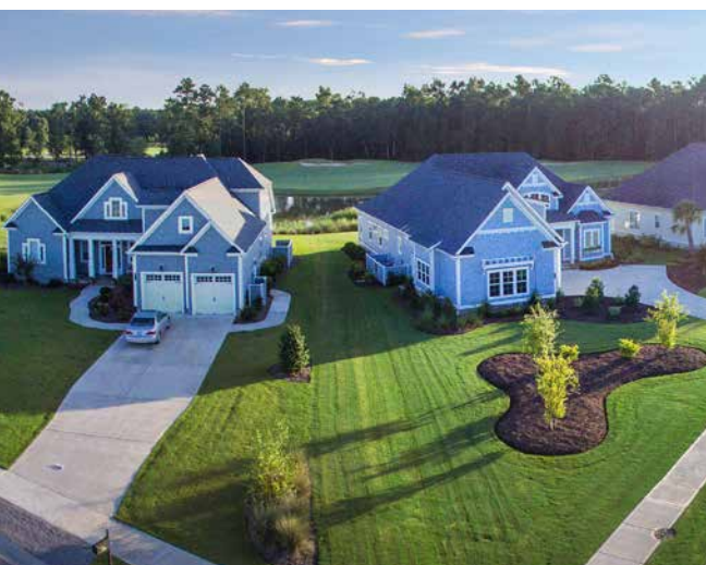
Cape Fear National homes are among the most desirable

At Brunswick Forest, would-be homeowners can choose a townhome or single-family model home that is ready for residents to move in immediately,