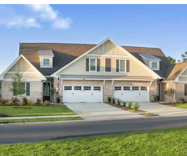
Maintenance-free townhome living appeals to many

Price points cover a wide range, too, with home sites from the $70s, and homes from the $200s to nearly a million dollars.