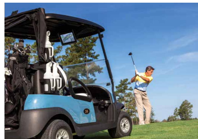
GPS-enabled carts provide a resort-like experience

This year also brought numerous amenity additions and upgrades, including the renovation of the main swimming pool in a community that offers three; the addition of a fleet of GPS-enabled golf carts that create a resort-style of play at Cape Fear National® golf course; and the launch of a new, responsive website that allows a seamless transition to mobile use. The new website also gives users