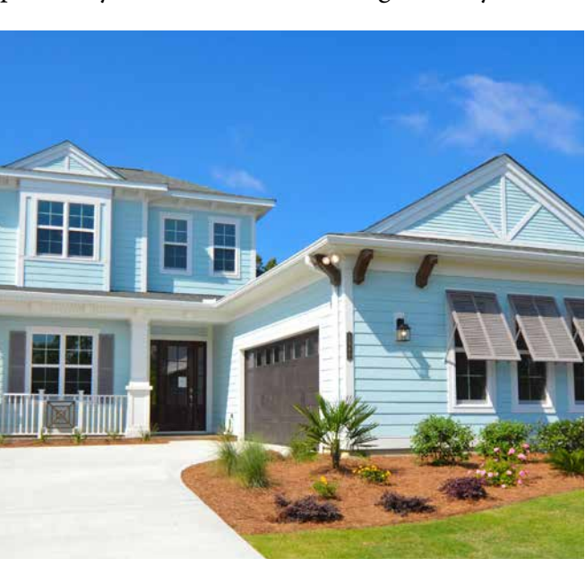
One of the West Indies-inspired Leewards homes