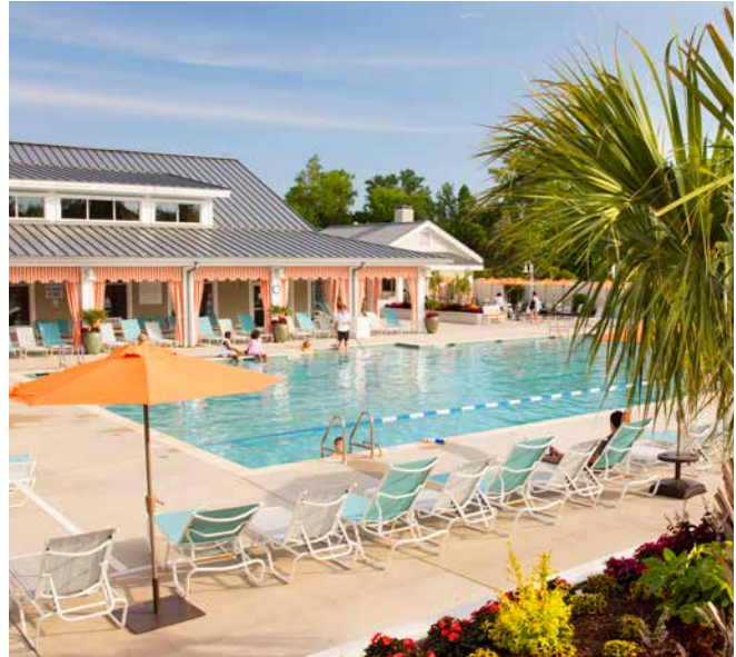
Renovated Fitness Center's outdoor pool

have an exceptionally strong builder team that is able to tackle large projects, such as entire new neighborhoods that showcase a consistent architectural style. In Banyan Bay, for example, we set a Floridian aesthetic in a gated enclave. The Leewards at Shelmore is West Indies inspired,