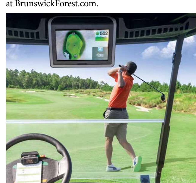
GPS carts enhance play at CFN

swimming pool in a community that offers three; the addition of a fleet of GPS-enabled golf carts that create a resort-style of play at Cape Fear National golf course; and the launch of a new, responsive website that allows a seamless transition to mobile use. The new website also gives users a direct link to the Cape Fear National site, and exceptional property search features. Take a look at BrunswickForest.com.