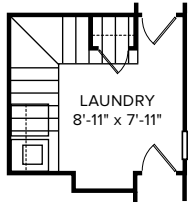
LAUNDRY ROOM LAYOUT WITH FLEX ROOM OPTION