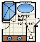
OPT. MAST. BATH