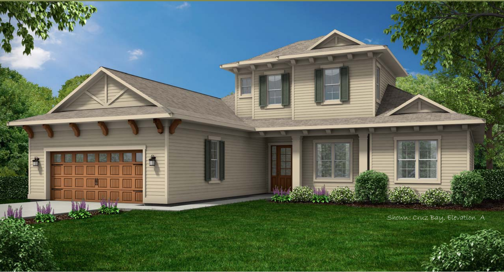
Shown: Cruz Bay, Elevation A